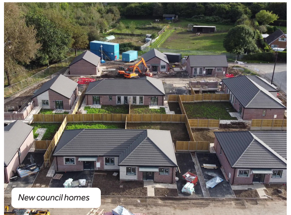
New council homes