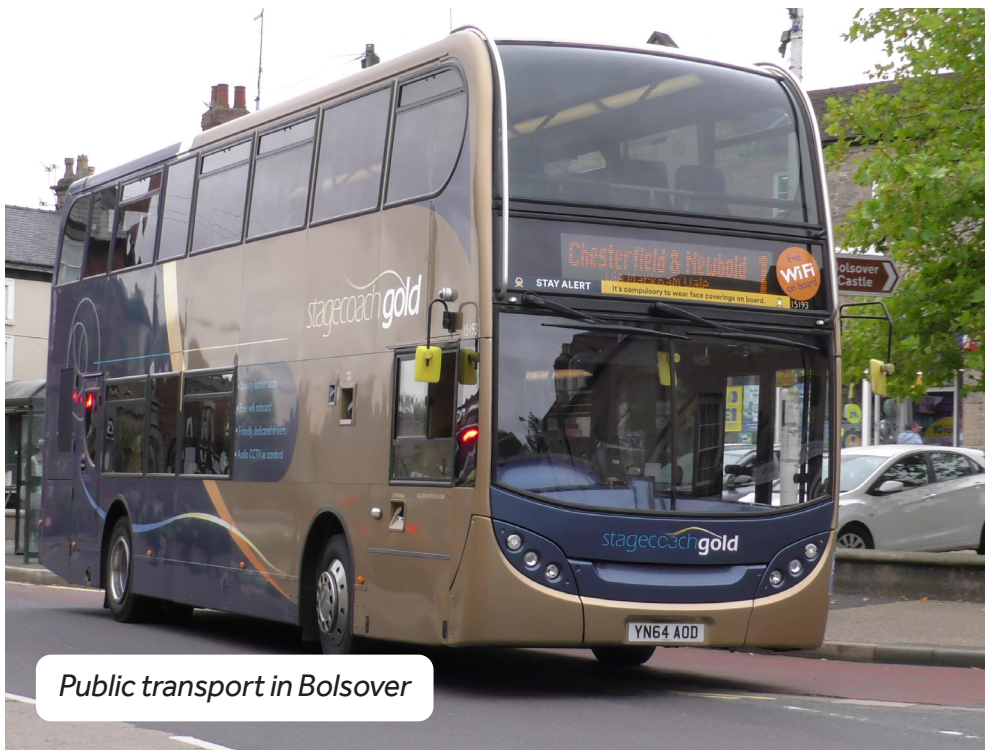
Public transport in Bolsover

You can find out more about Claire and what she stands for at www.claireward.co.uk