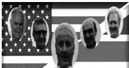
'SPIRIT OF THE SIXTIES'