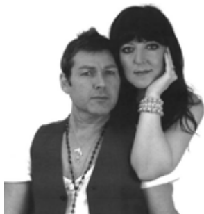
Saturday 12th February Vocal & Instrumental Duo 'MAN MAID'